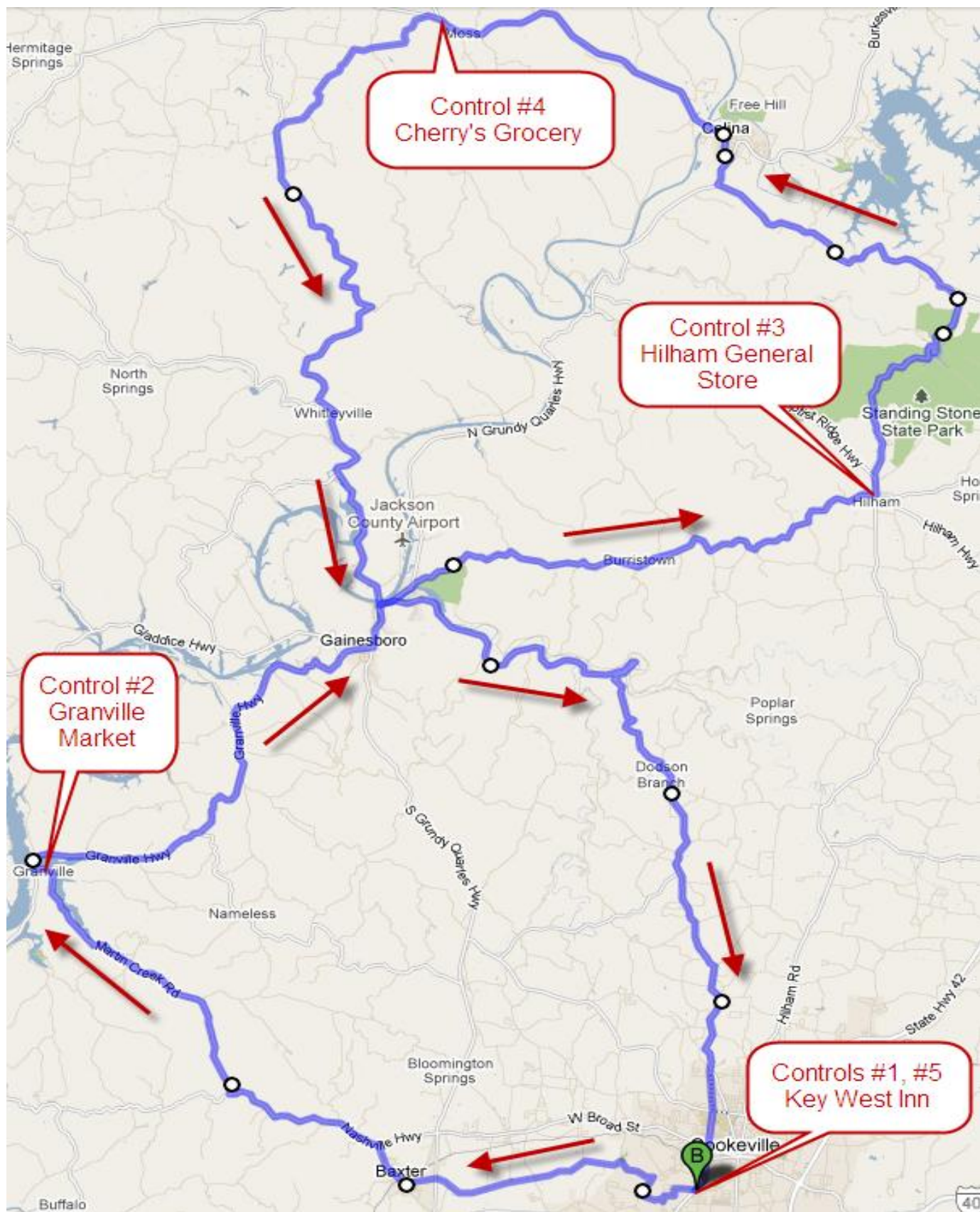
Map - West Start